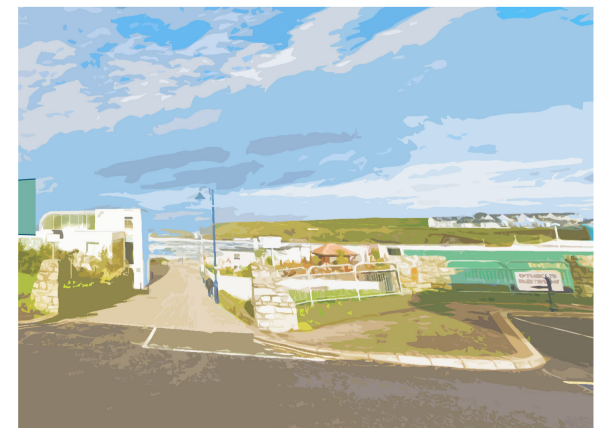
B6 - Central Lane (Seaside)