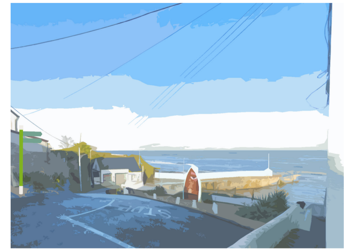
A8 - West End Road X Bundoran Pier