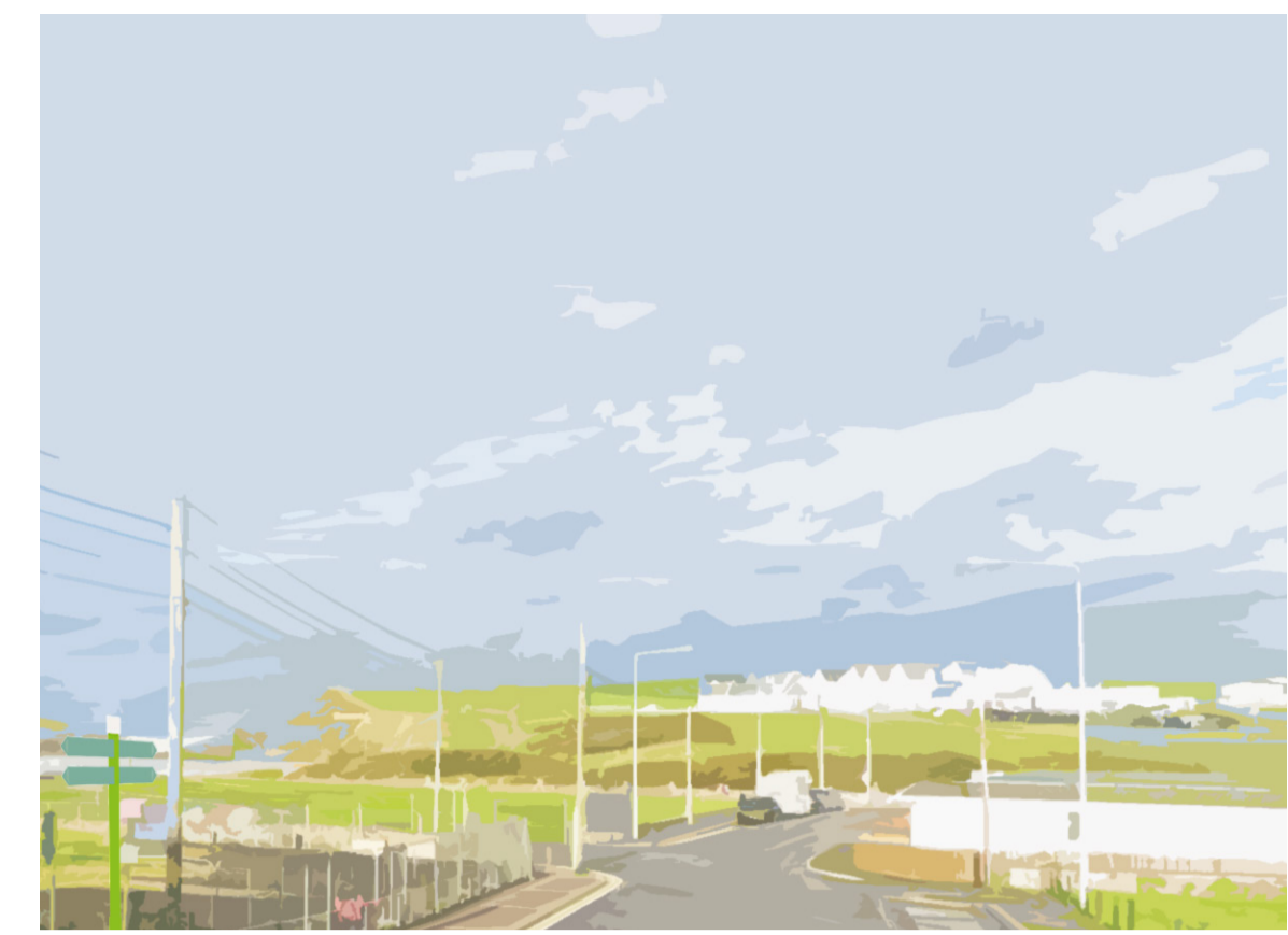
A4 - Astoria road X Atlantic Way