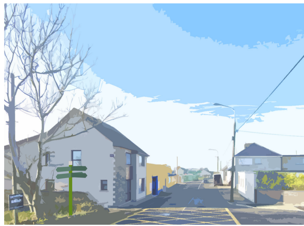
A1 - Tullan Strand X Finner Road