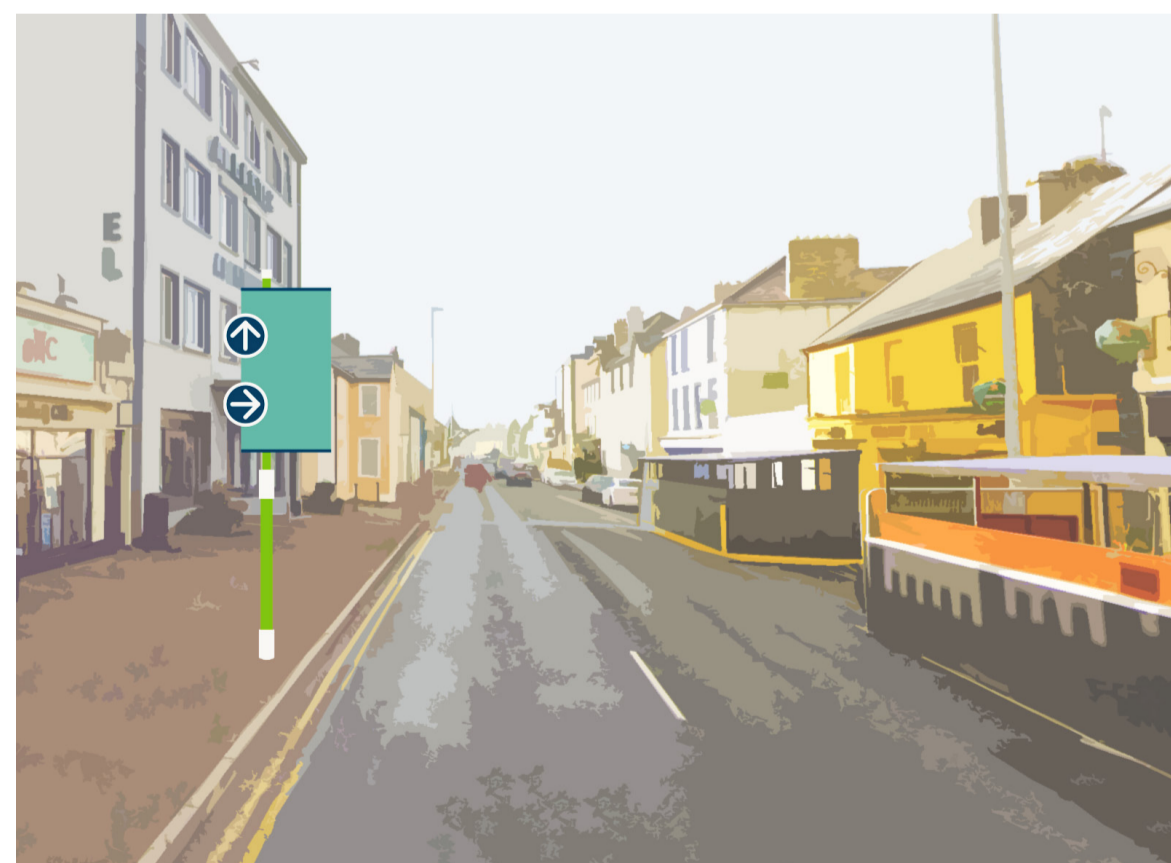
B3 - Meehan's Lane (Main Street)