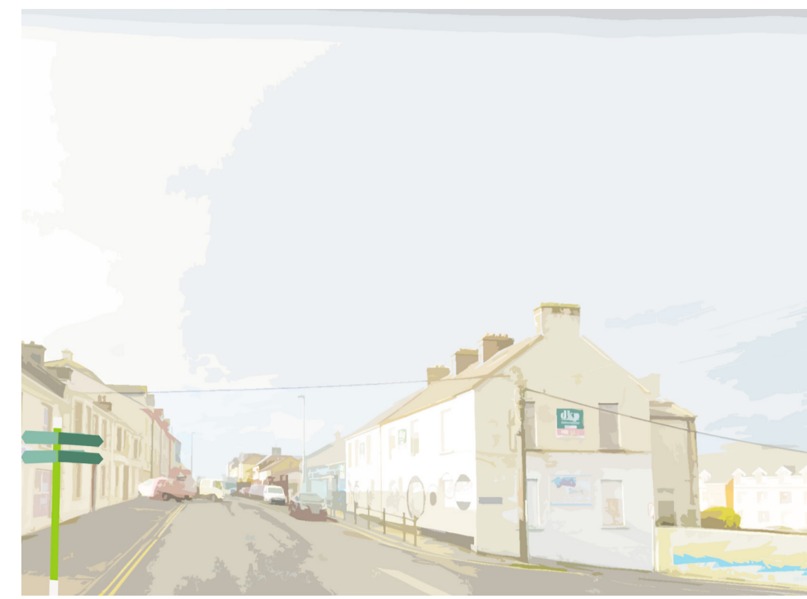
A3 - Main Street X Astoria Road