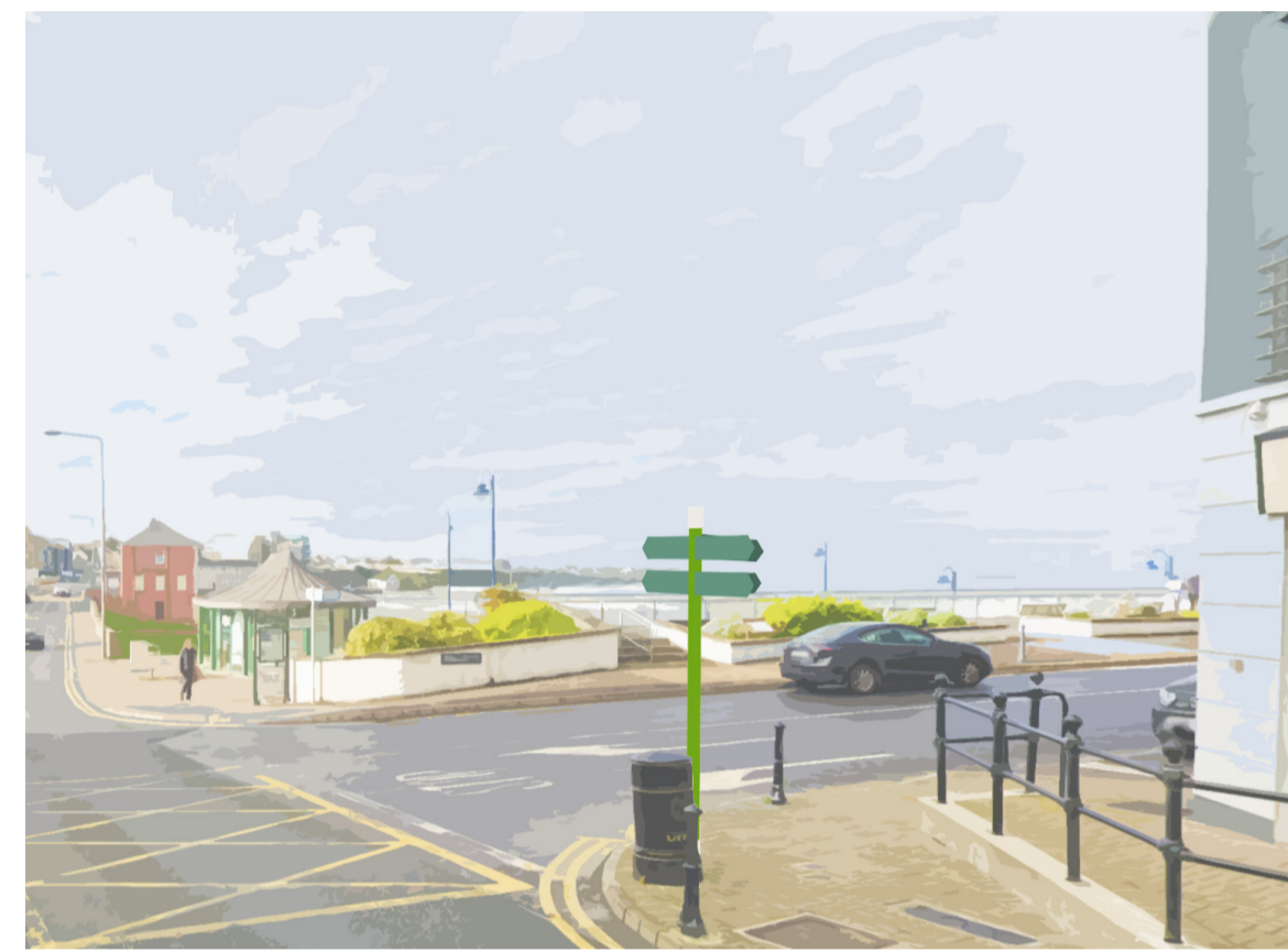
A6 - Main Street X Promenade Road