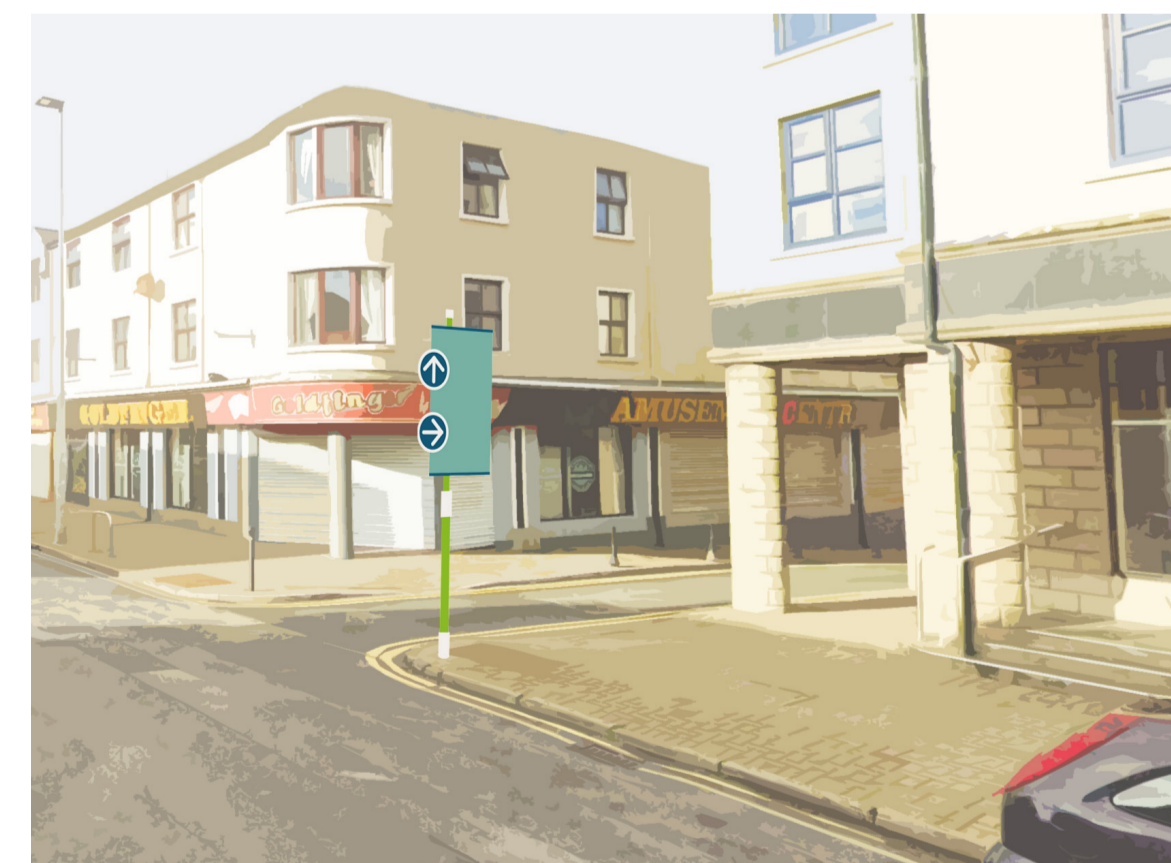
B5 - Central Lane (Main Street)