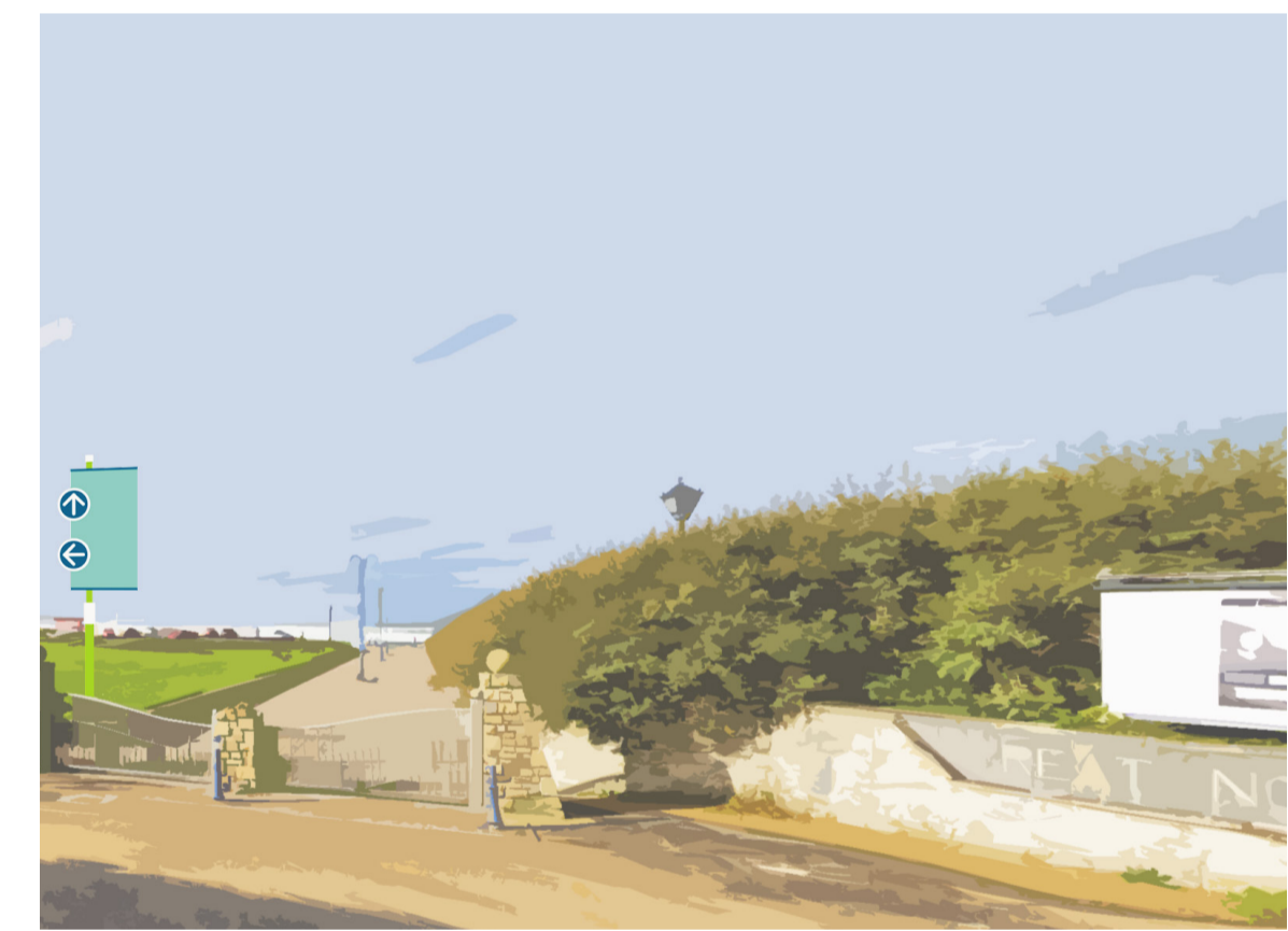
B2 - Sea Road, Main Beach & Golf Club