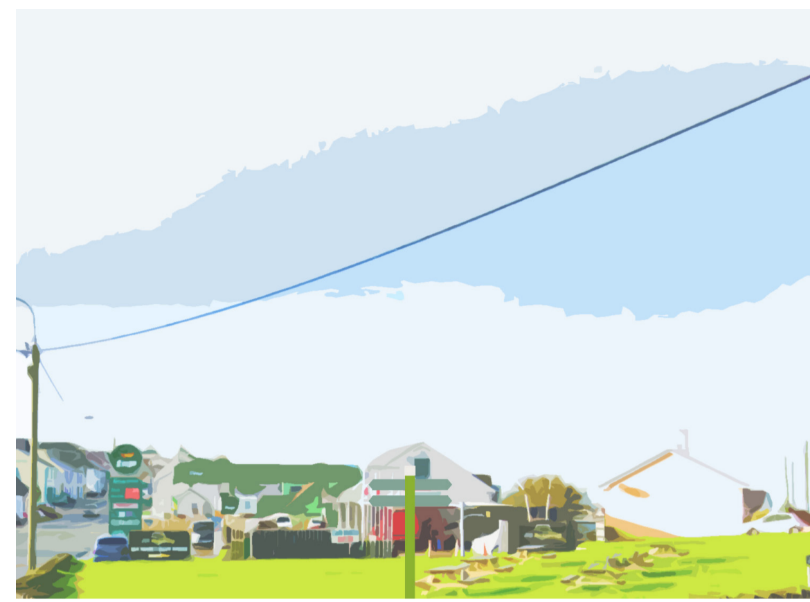
A2 - East End X Sea Road