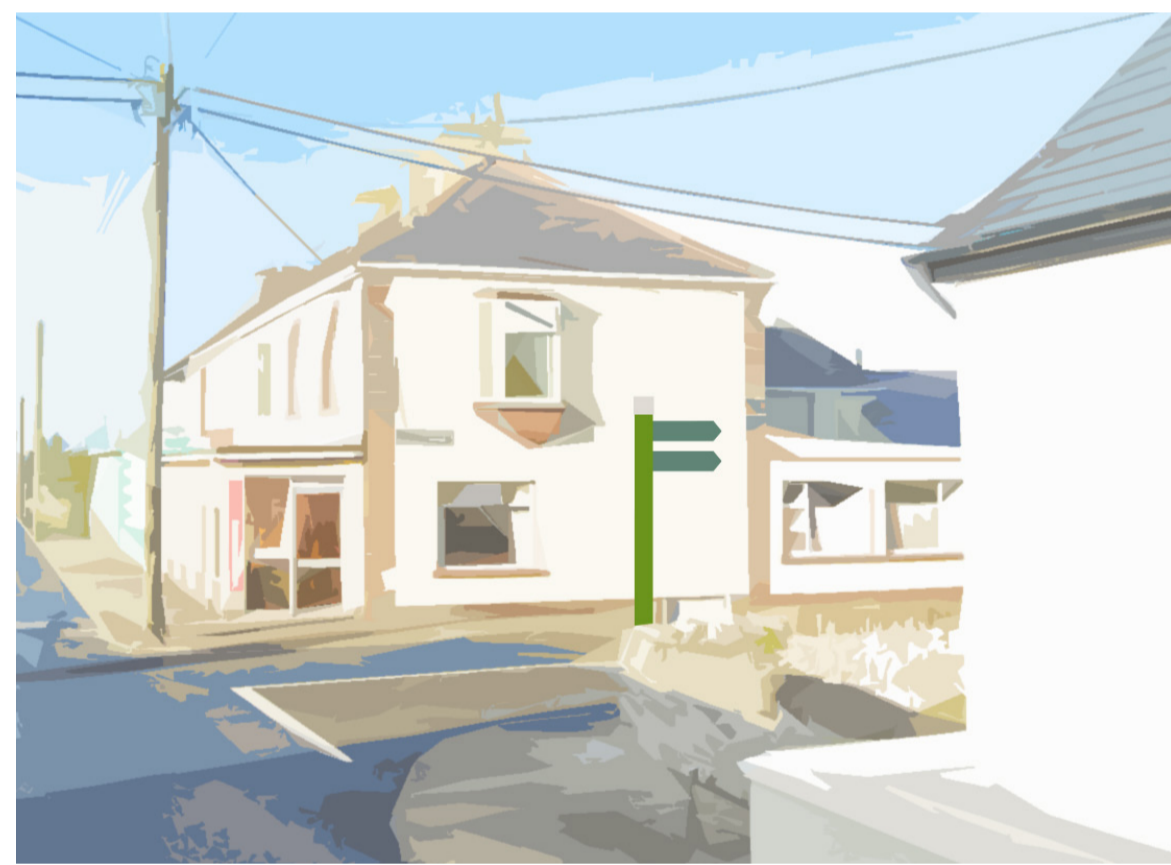
A9 - West End Road X Shene Avenue