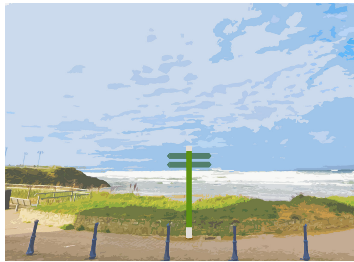
A5 - Promenade X Central Lane