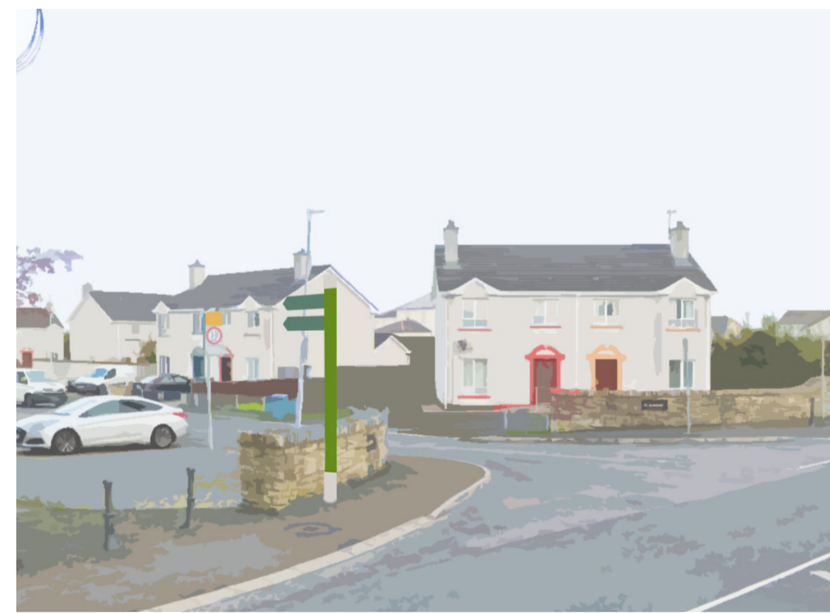
A10 - West End Road X Elaghmore