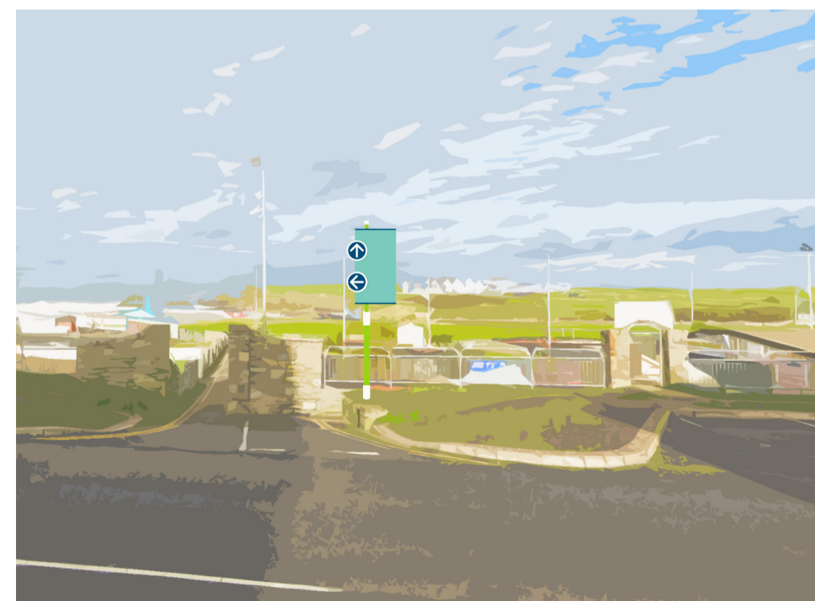
B4 - Meehan's Lane (Seaside)