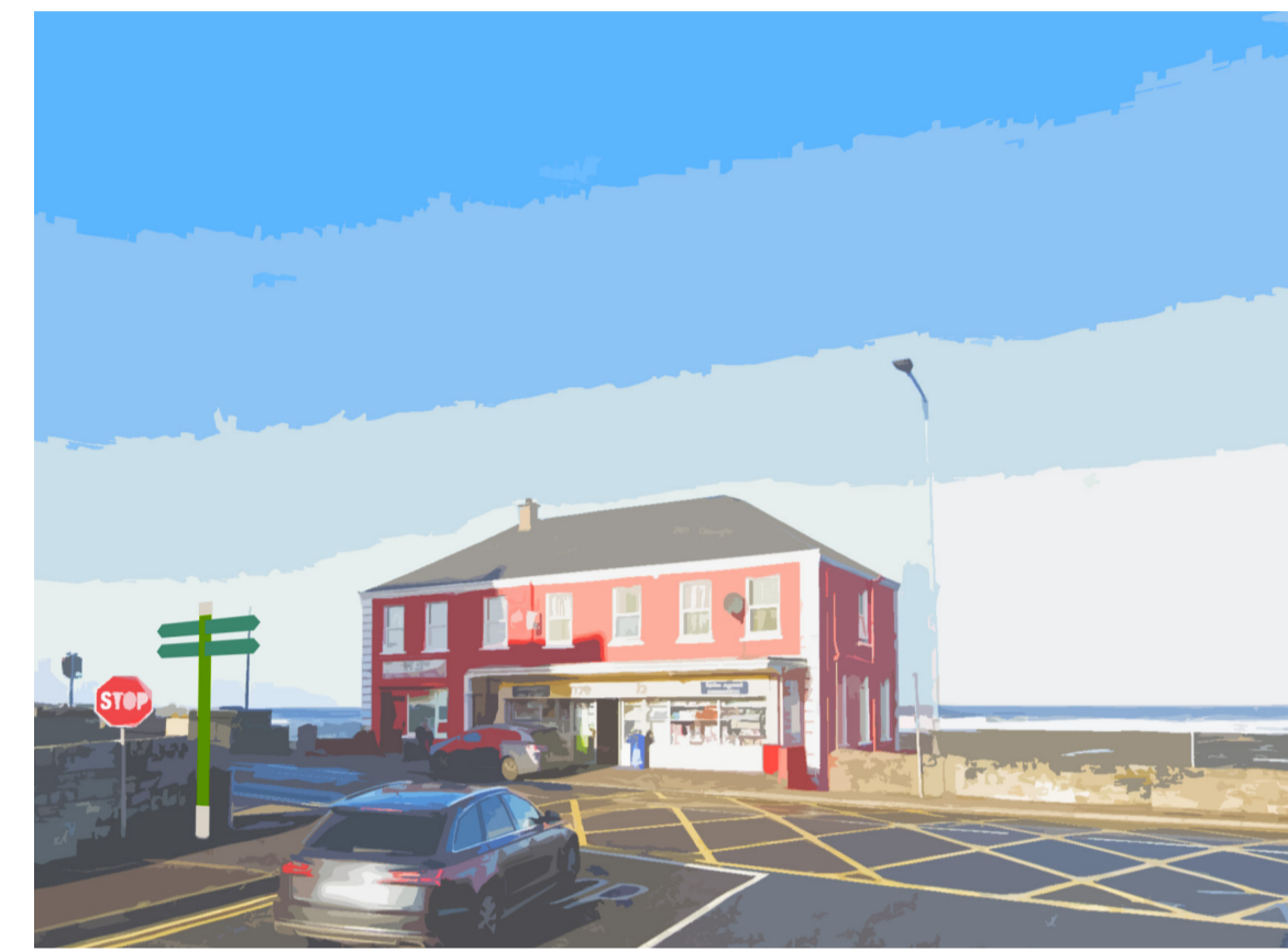
A7 - Main Street X Church Road